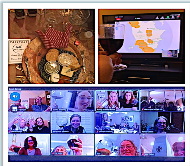
HWC members participating in the virtual wine & charcuterie board tasting on January 21st.

The Heathrow Women's Club members participated in a private virtual wine & charcuterie board tasting on January 21st. Twenty members enjoyed an evening tasting four different wines from regions in Greece, France, Spain, and Italy with commentary by a wine distributor/connoisseur. The cheeses and other delicacies were delicious and paired beautifully with the wines.