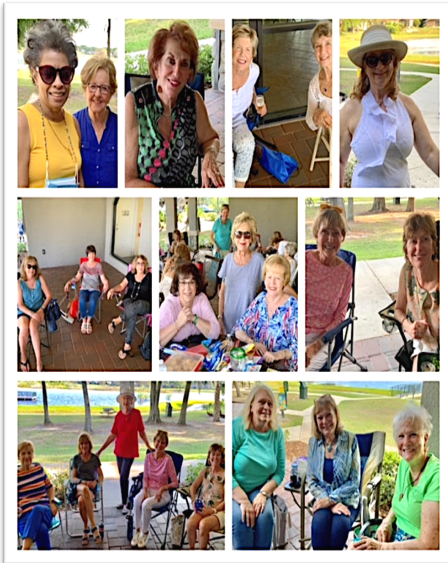
March 25th HWC Ladies Night Out at Sawyer Lake Park.

Nearly thirty ladies turned-out on March 25th for our Ladies Night Out at Sawyer Lake Park. It was evident that members were very excited to safely be together.