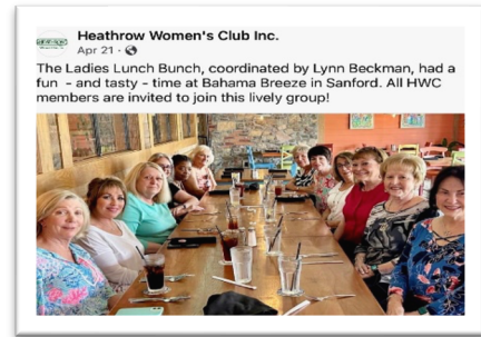
HWC Facebook page highlights member activities.

We promoted our fundraisers through a variety of channels including signage within Heathrow and at the gate. Our HWC Facebook page continually features members and photos along with announcement of fundraisers and social events. Instagram is used less but occasionally has information about the club. PR continually seeks members to participate on this team. We need photos and social media savvy folks to continually promote the good work we do in our community.