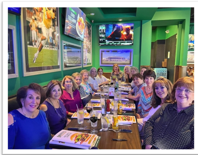
Ladies Night Out May 25 th at Duffy's