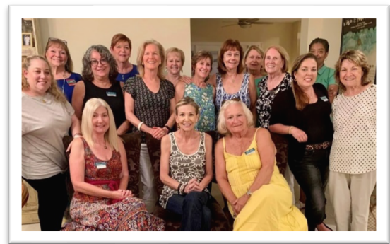
HWCC new members' orientation May 4th

Heathrow Women's Club Heathrow Women's Club Charities, Inc. contact@heathrowwomensclub.org