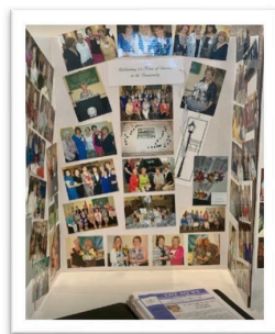
HWC is featured in Lake Mary Life and Heathrow Stroll magazines. Displays to celebrate the 35th Anniversary.