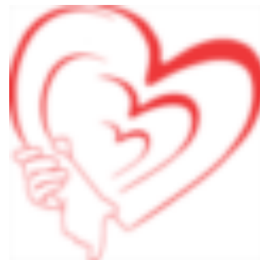
Heart, Hands and Hope