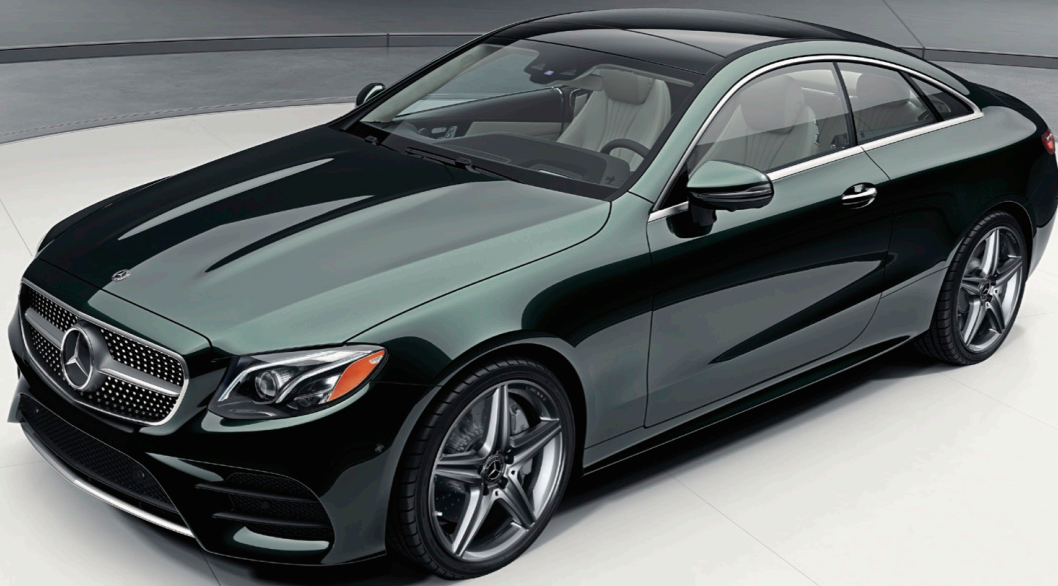
New 2018 Mercedes-Benz E 400 Coupe