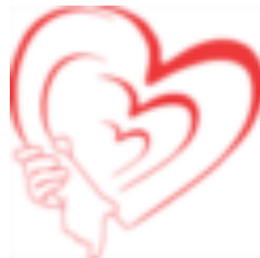
Heart, Hands and Hope