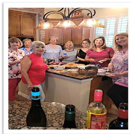
HWCC BUNCO group

Please contact me with any questions or ideas for activities.