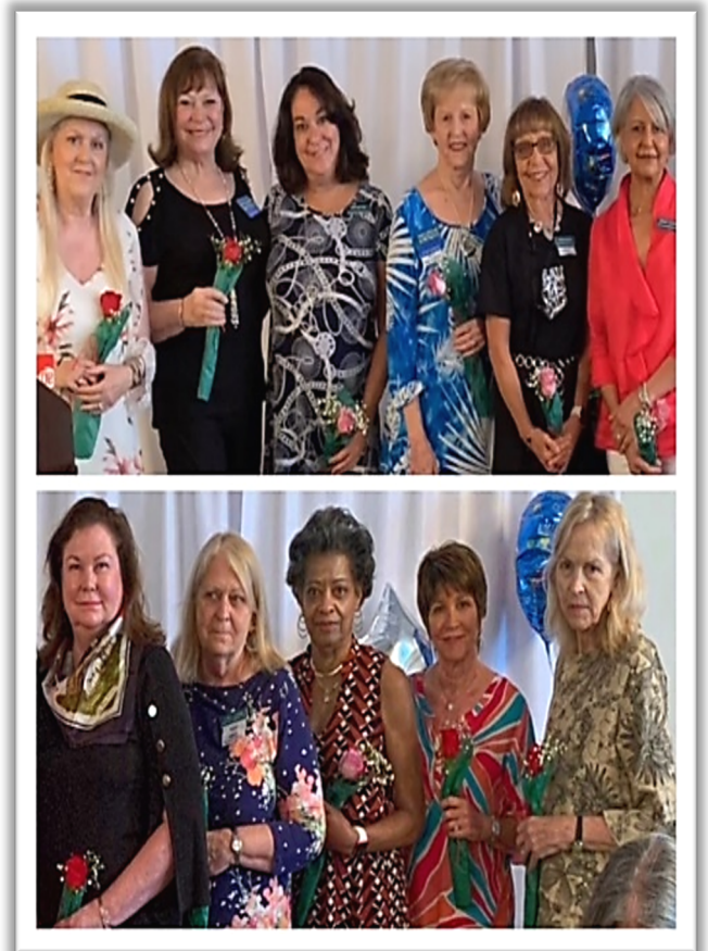
The 2021-2022 HWCC/HWC Board of Directors

Heathrow Women's Club Heathrow Women's Club Charities, Inc. contact@heathrowwomensclub.org