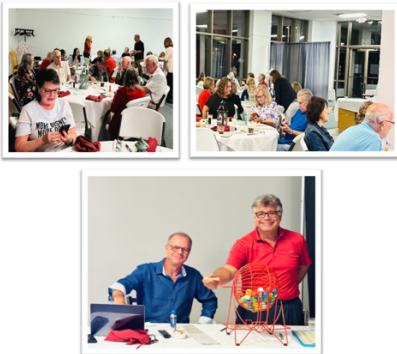
Bingo night was a complete success!